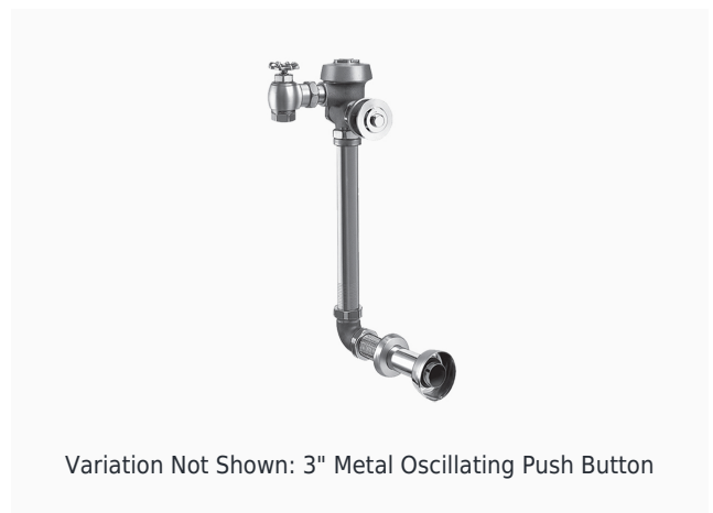
Variation Not Shown: 3" Metal Oscillating Push Button